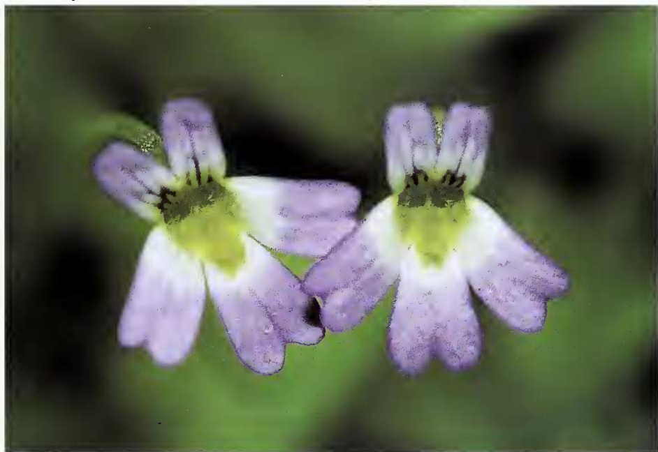
Figure 5. P. crystallina subsp. hirtiflora from Botanical Garden of Calabria University in full anthesis, particular of the flower.